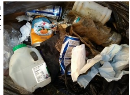
A sample of what we collected last year – as if you didn't know the kind of thing!