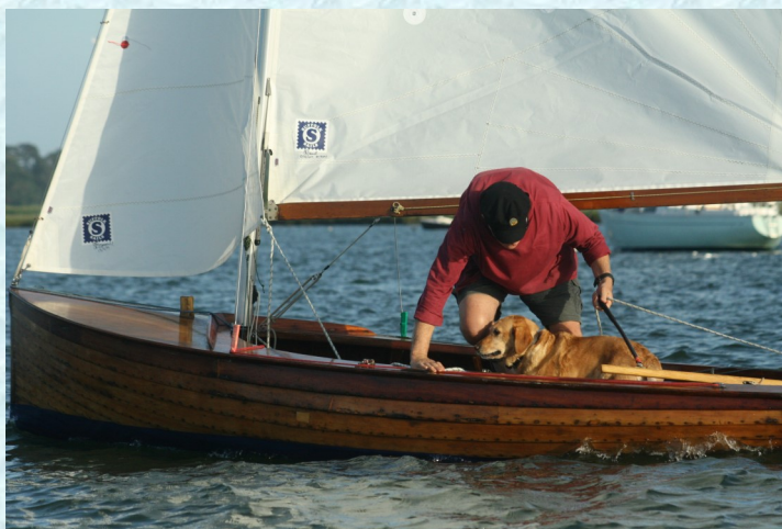
'One man and his dog' at the 2019 Regatta

Looking further ahead, the club's Regatta starts on 17th July, with races and shore games for children – good spectator sports! The Regatta ends with the much-loved Yachtsmen's Service at 6pm on 19th July, to which all are welcome.