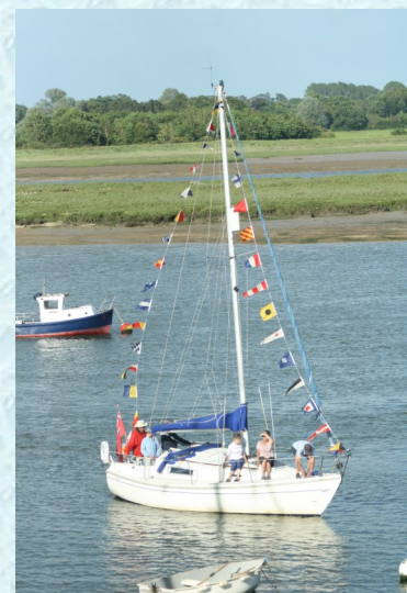
Yacht arriving for the Yachtsmen's Service